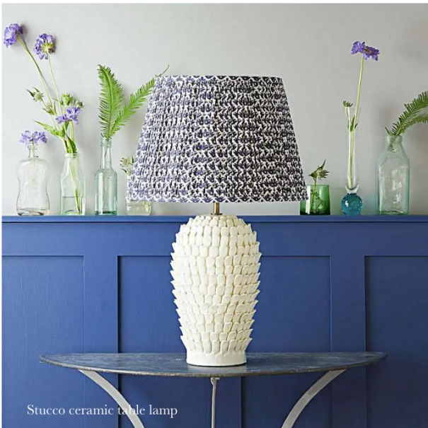
Stucco ceramic table lamp

The first ever order I placed with Pooky was for the Large Mojo Light, which is my all-time favourite, it stands proudly in my sitting room [see the picture, top]. Unfortunately, this lamp is no longer in production but the Stucco Table Lamp is pretty fab too!